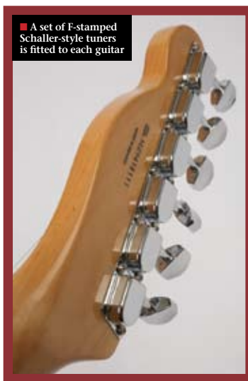
■ A set of F-stamped Schaller-style tuners is fitted to each guitar

"Over the past six years now I have reworked hundreds of these reissue pickups back to vintage specs with much success. In the beginning, I simply removed the potting, rewound them to the proper resistance and replaced the bar magnets and steel screws with pressed-in rod magnets with a faux screw head. However, about half a year ago I successfully sourced a good threaded screw magnet. This simple modification makes a world of difference in tone, and successfully takes the reissue back to sounding like the original vintage Wide Range humbucker."