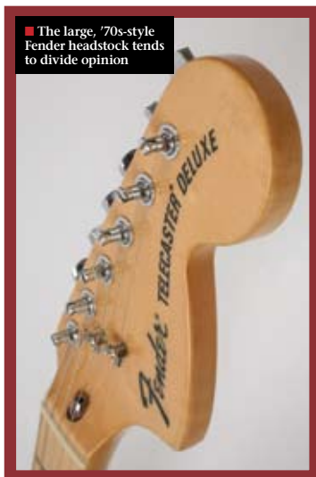
■ The large, '70s-style Fender headstock tends to divide opinion

The original Deluxe was – for '50s Fender purists at least – a clumsy looking mutant that mocked the