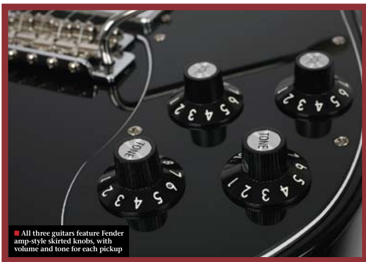
■ All three guitars feature Fender amp-style skirted knobs, with volume and tone for each pickup